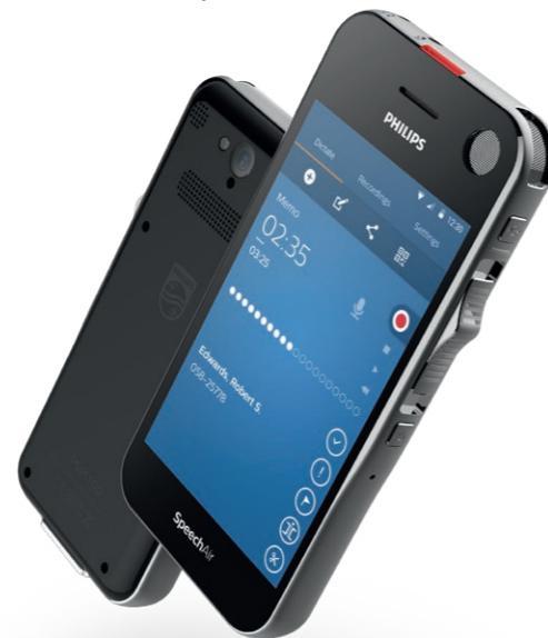
Philips SpeechAir Smart Voice Recorder