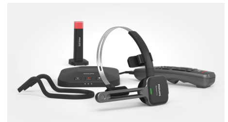
Wireless Dictation Headset, Docking Station, Status Light and Remote Control