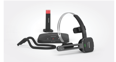
Wireless Dictation Headset, Docking Station and Status Light